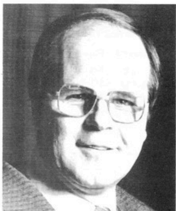
Peter Day Freddy Eynsford-Hill