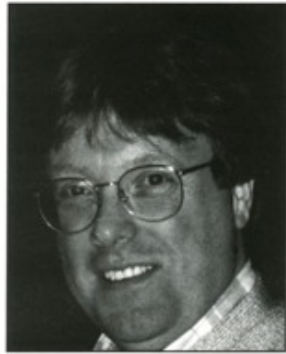
Capt. Georg von Trapp